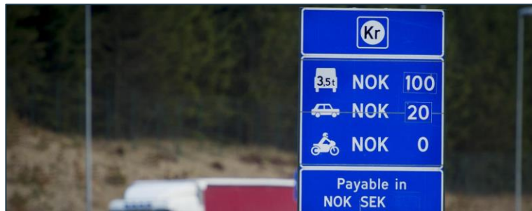
Continued favourable tollrates