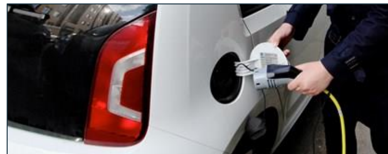
Priority on parking and charging E-LCV in urban areas