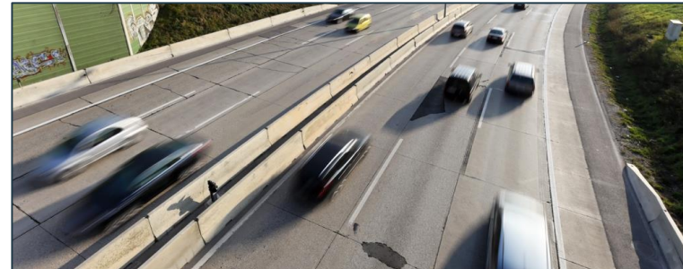
Accessibility (priority in Bus lanes for E-LCV)