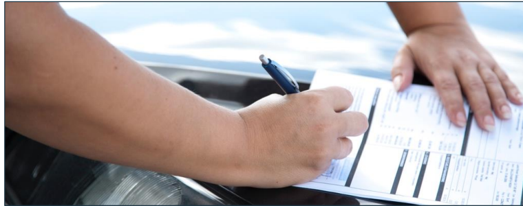
Still favourable registration tax to ICE vehicles